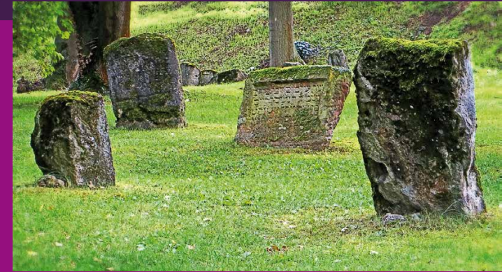
Mainz, Jewish Cemetery

The ShUM-Cities Speyer, Worms, Mainz e. V. association is supported by the German State of Rheinland-Pfalz, the cities of Worms, Speyer, and Mainz, the Jewish Communities of Mainz and Rheinpfalz, the State Association of the Jewish Communities Rheinland-Pfalz.