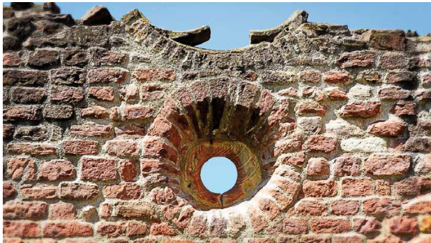
Speyer, Remnant of the Synagogue wall

The radiance of the former ShUM-Cities is unbroken, on the Rhine and throughout the world. Stone monuments from the Middle Ages – synagogues, tombstones, cemeteries, ritual baths – have been preserved, reconstructed and archeologically protected.